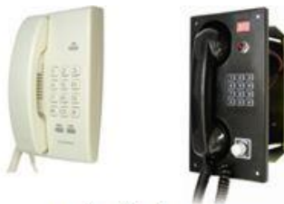
Desk / Flush Phone

The system is tested according to IEC60945 and pending certificate for CE by DNV Registry.