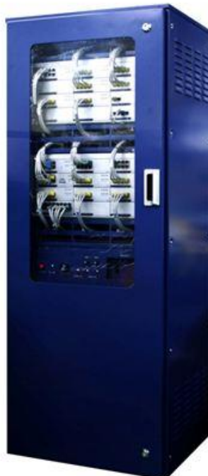
PABX Main Cabinet