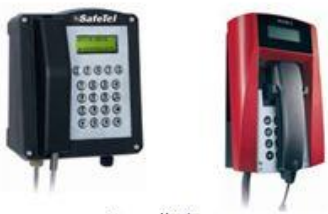
Ex wall Phone