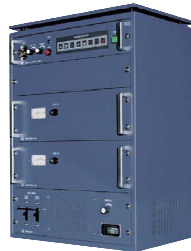
MPA-2000 Main Cabinet