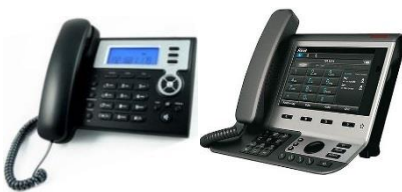
Desk / IP-Phone