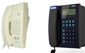
Wall Type Phone