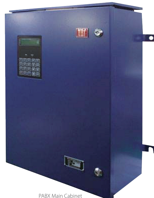
PABX Main Cabinet